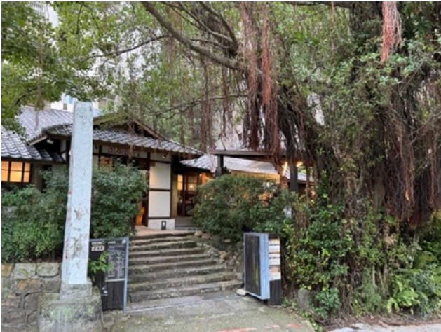
Outside the Hot Springs Bathhouse