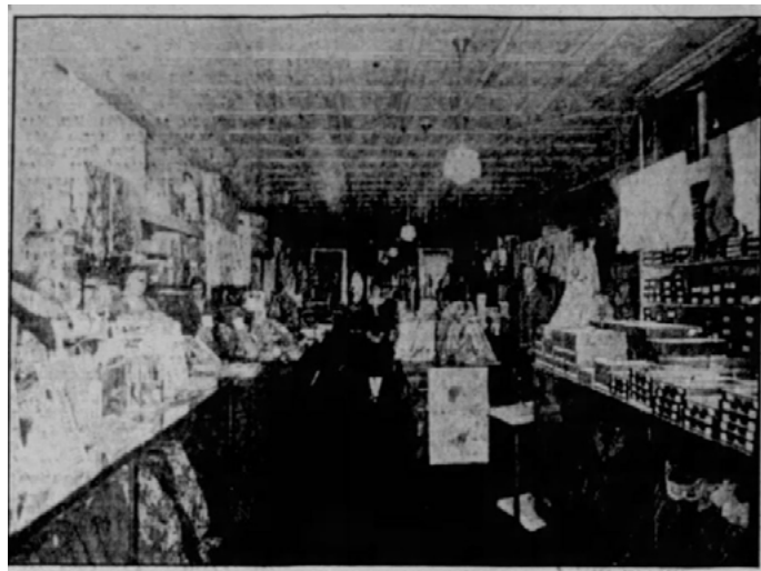
The interior of Adams Dry Goods Store in 1930.