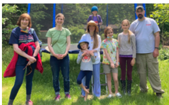
UUCE Religious Education