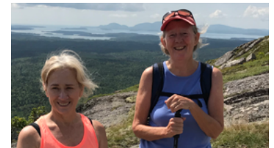
UUCE Scheduled Hikes