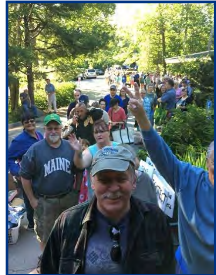
Hordes Descend on Our Giant Yard Sale!