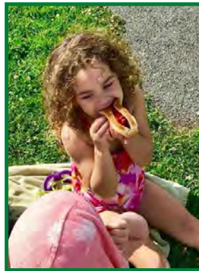
Lamoine Beach Picnic July 29