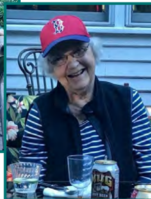
Happy, Hearty Eaters at the Southern Picnic!