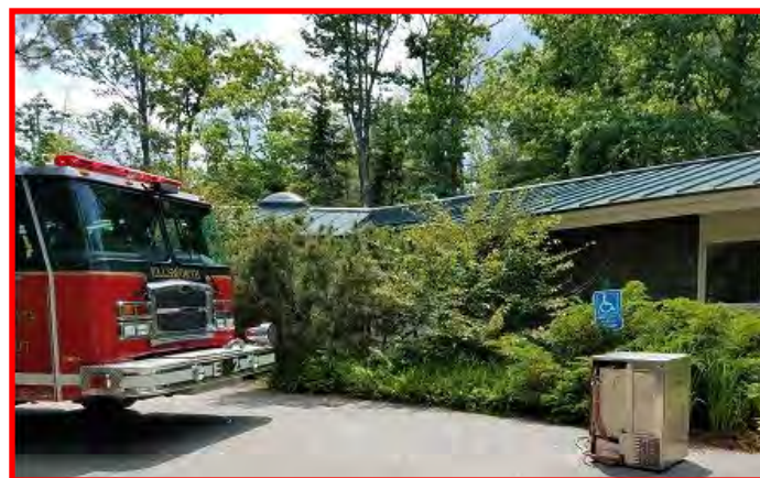
Good To Know: Firemen Can Make It to UUCE in Under 3 Minutes When a Dishwasher's on Fire!