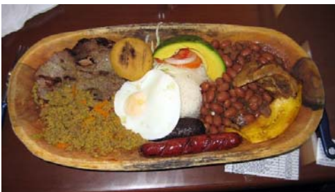
"Bandeja Paisa", Cartagena, Colombia