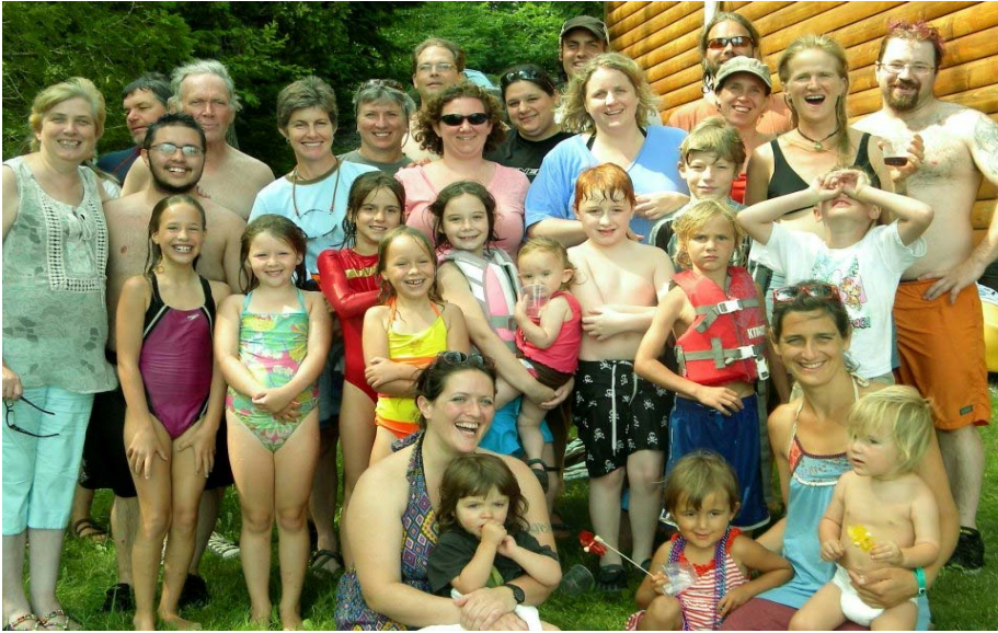
Most of the gang!